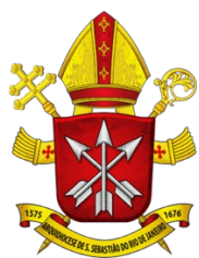
Dom Orani João Cardeal Tempesta, O.Cist. Arcebispo de São Sebastião do Rio de Janeiro